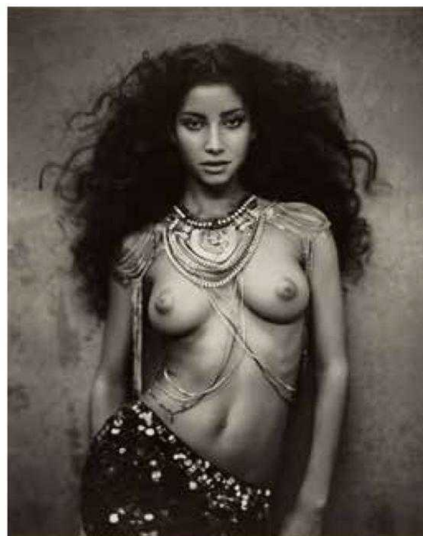
La Perle de Tahiti