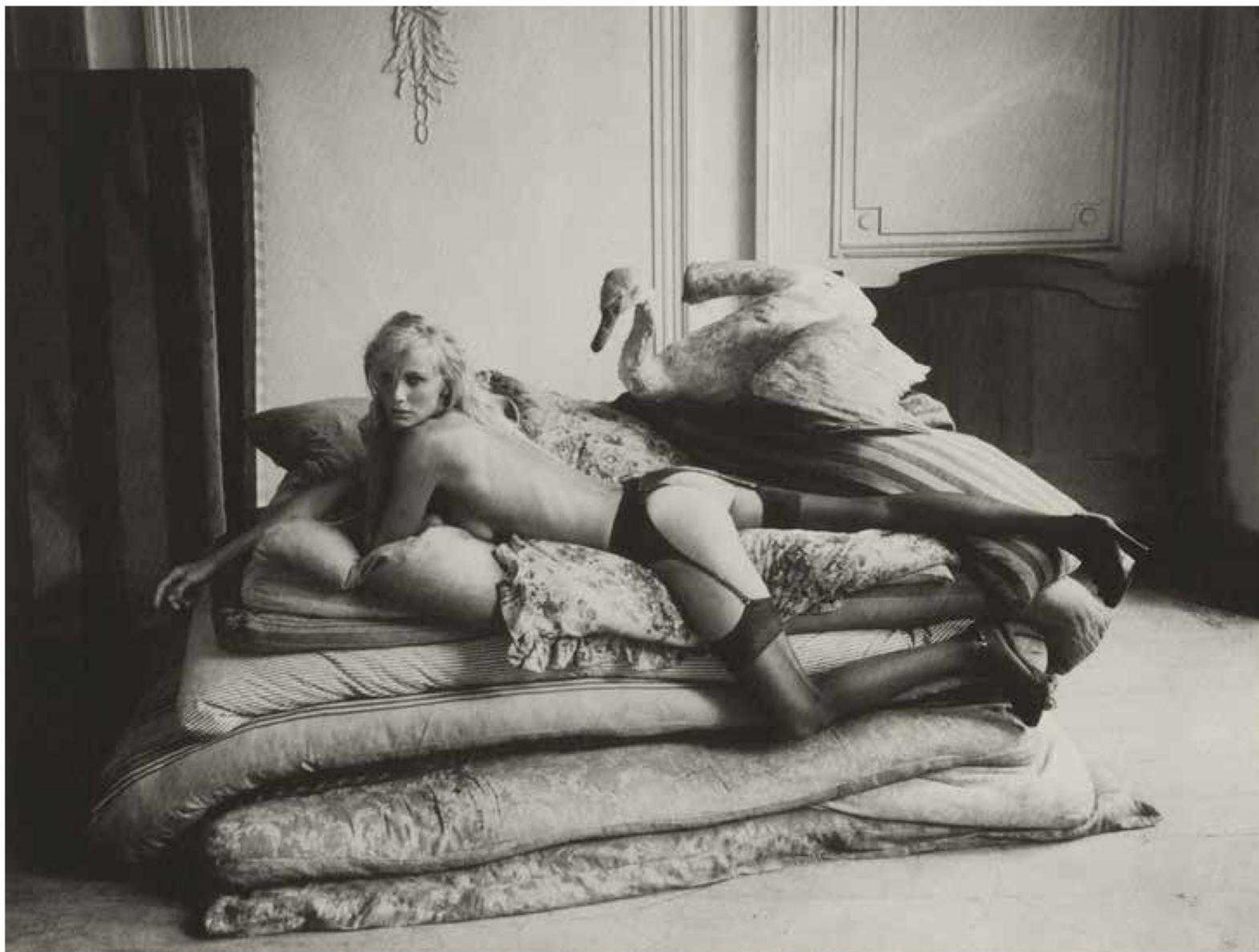
Princess and the Pea