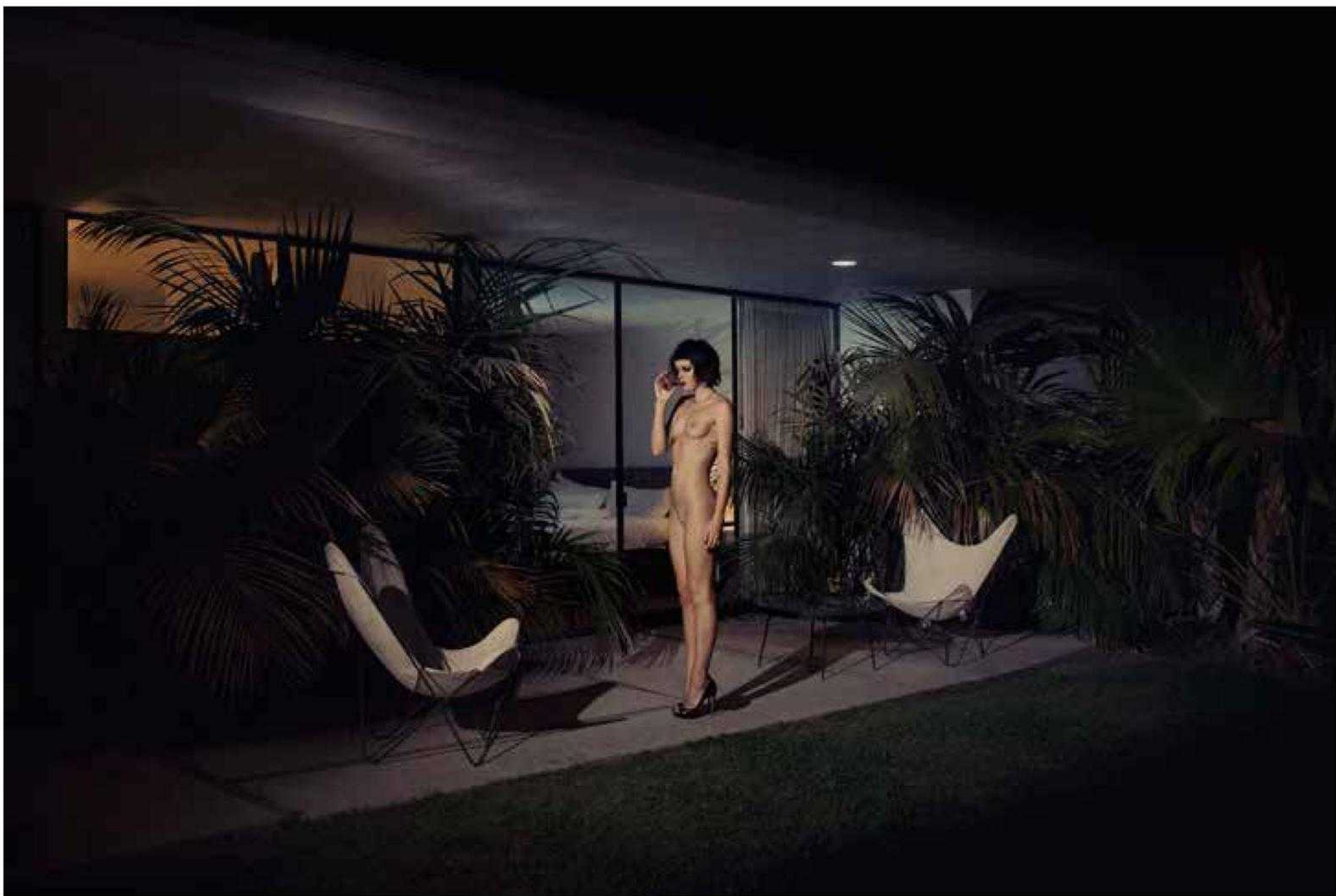
Chateau Marmont Room Service