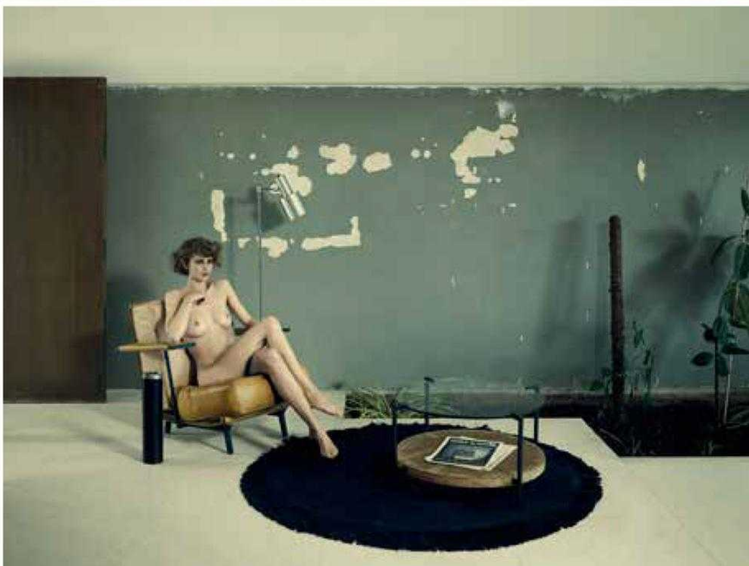
Top: The Interview Before ; Bottom: The Interview After